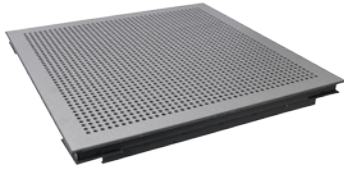
23% open airflow panel