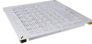
56% Triad Chamfer ICE™ airflow panel

3-Year Standard Panel Warranty: Haworth TecCrete panel offers the industry's longest standard warranty on the structure of the access floor panel.