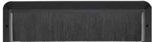
AIRGUARD Surface Mount, showing components