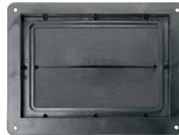
AIRGUARD Extreme Bottom, showing gasket material